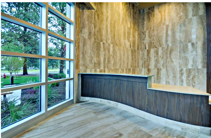
ABOVE, LEFT: This custom conference table base is a reclaimed airplane wing, a nod to the client's aerospace industry. ABOVE, RIGHT: The reception area at the Quality Thermistor in Boise, Idaho, showcases recycled aluminum tile on a radius on the reception station and energy-efficient accent lighting. BOTTOM, LEFT: The reception area and lobby of the Veterans Administration Regional Office building features locally quarried Idaho travertine and FSC-certified walnut

done where we have written our own "green" program and set forth targets at the beginning of the project. One of our goals on this project was to divert at least 50 percent of construction waste from the landfill.